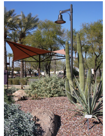
Desert Fusion Garden at the Municipal Complex

We also have short-term plans to implement high efficiency lighting in street lights and traffic signals, increase transit options, and incorporate more transit-oriented development in our community.”