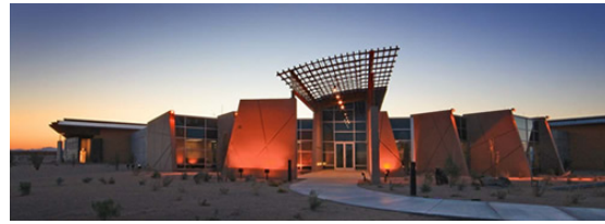
Butler Water Reclamation Facility